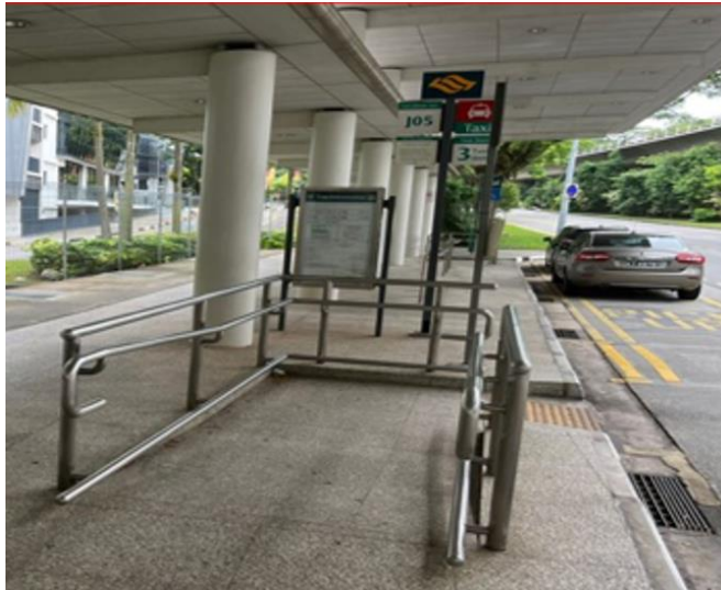
Photo 2: Shuttle Bus Pick-Up Point at Dover MRT Station Exit “A” Bus Stop