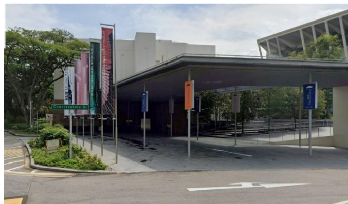
Photo 6: Photo of Drop-Off Point 2 for Taxi, Private Hire Car and Shuttle Bus Service