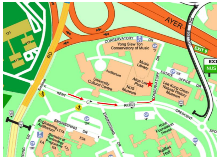
Photo 4: Location Map of Two Drop-Off Points for Taxi and Private Hire Car