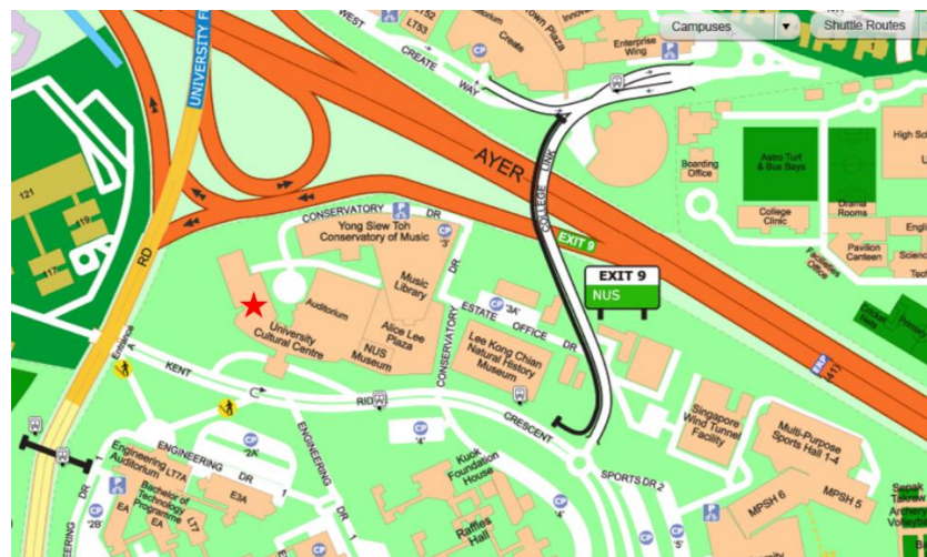
Photo 1. Location map of UCC